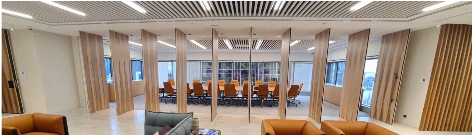
Gilbert + Tobin's Boardroom with open SW200 doors

"The ASSA ABLOY SW200 OHC is the ideal choice for applications with high demands on gentle and smooth operation in combination with strength and high traffic flow. It compensates for stack pressure and wind load and yet it remains easy to open manually."