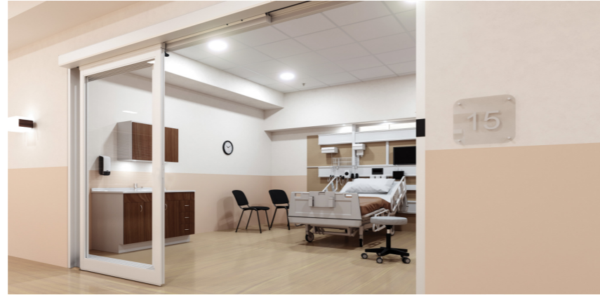
Touchless ICU Doors

We offer the industry's most complete, flexible service solutions, including regulatory compliance checks and upgrades. Our local experienced technicians respond quickly to issues to ensure that your doors, no matter the brand, are fully operational, and downtime is kept to a minimum.