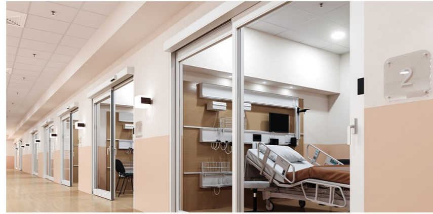
Touchless ICU Doors

We offer the industry's most complete, flexible service solutions, including regulatory compliance checks and upgrades. Our local AAADM certified technicians respond quickly to issues to ensure that your doors, no matter the brand, are fully operational, and downtime is kept to a minimum.