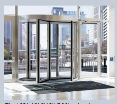
The ASSA ABLOY SW200i swing door operator complies with emergency egress requirements.