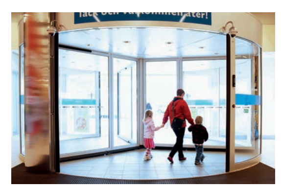
Adding customer convenience while saving energy

The compact ASSA ABLOY RD4 revolving doors with its aesthetic design was an ideal match for the newly remodeled facade in Audi Forum and Museum in Ingolstadt, Germany. The revolving doors eliminate drafts and reduce energy losses.