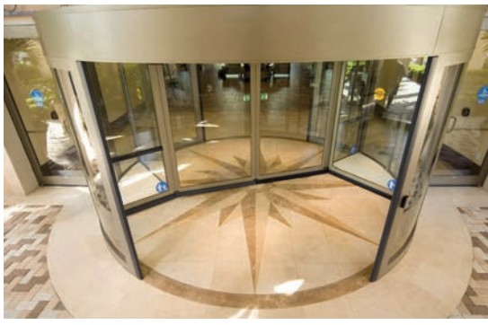
A comfortable, inviting indoor environment To handle a heavy traffic flow, provide substantial energy and savings by preventing conditioned air loss, a large ASSA ABLOY UniTurn with a special colored finish was selected for the Gaylord Palms Hotel and Conference Center in Orlando, Florida, USA.