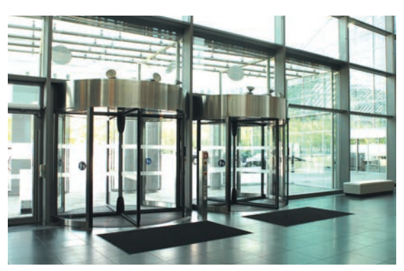
The perfect match for a modern, new building entrance

The compact ASSA ABLOY RD4 revolving doors with its aesthetic design was an ideal match for the newly remodeled facade in Audi Forum and Museum in Ingolstadt, Germany. The revolving doors eliminate drafts and reduce energy losses.