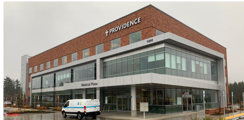
On demand, contract and 24/7 service for all brands of automatic doors