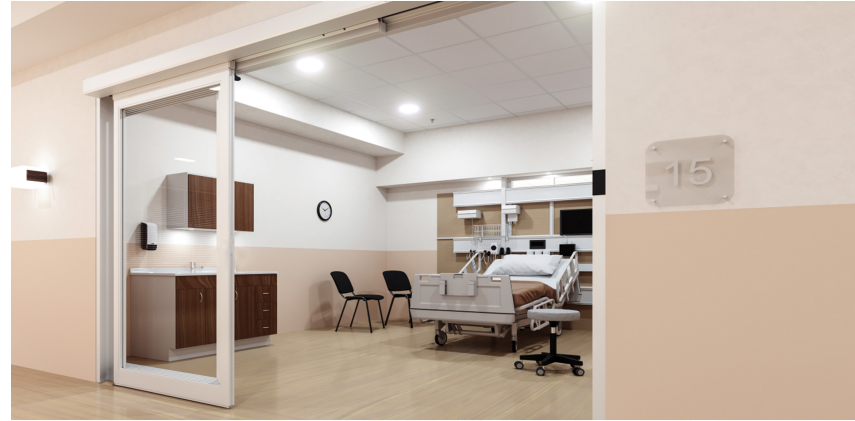
Touchless ICU Doors

We offer the industry's most complete, flexible service solutions, including regulatory compliance checks and upgrades. Our local experienced technicians respond quickly to issues to ensure that your doors, no matter the brand, are fully operational, and downtime is kept to a minimum.