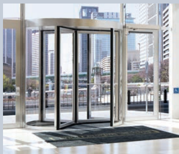
The ASSA ABLOY SW200i swing door operator complies with emergency egress requirements.